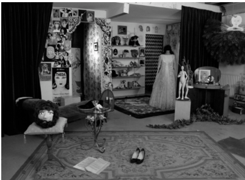
Georgina Starr, Theda , 2009. installation detail, video (35 min) and studio set