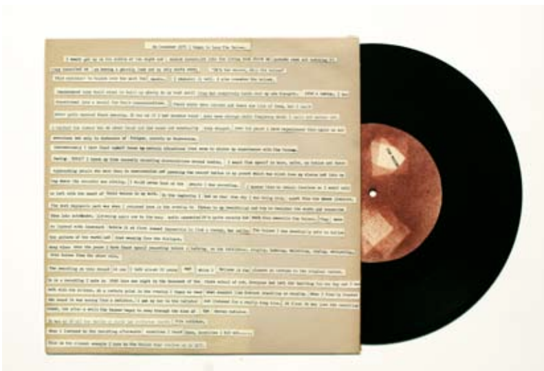
Georgina Starr, The voices , I am a record , 2009 12 inch vinyl record and cover artwork